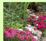
✓ Flowers & Weeds