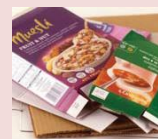
X Metal, Glass, Paper, Plastic, Cardboard