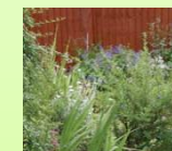
✓ Shrub Cuttings