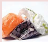
X Plastic Bags