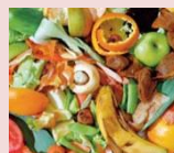
X Food Waste & Peelings