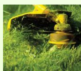
✓ Grass Clippings