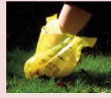
X Pet Waste