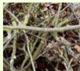
✓ Pruning & Twigs