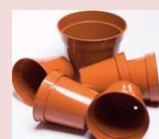
X Flower Pots