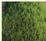
✓ Hedge Clippings