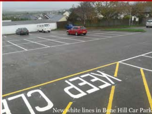
New white lines in Bone Hill Car Park